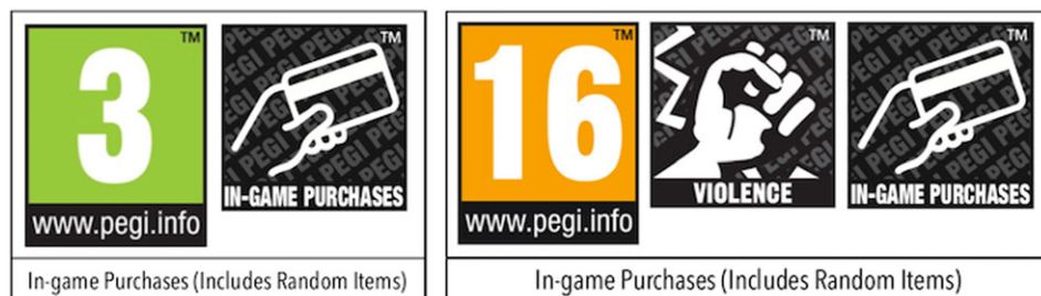
Figure 3. The current PEGI ‘In-game Purchases (Includes Random Items)’ content descriptor.

its label to instead read ‘In-game Purchases (Includes Random Items)’ (figure 3), which is identical to the ESRB’s (except for the capitalization of the ‘G’), soon after the initial announcement (without a further announcement) by retroactively partially changing the initial announcement (see §4.3.3 for further detail). As of 16 January 2023, the PEGI announcement’s text still referred to the older label, but the image accompanying has been changed to reflect the current (i.e. the ESRB’s) label. These two largely identical labels are intended to cover, according to the ESRB, ‘all transactions with randomized elements’ [3]. The ESRB and PEGI both consciously chose to specifically not use the term ‘loot boxes’ to ‘avoid confusing consumers’ [3], particularly parents who might not have sufficient knowledge about video games or ‘ludoliteracy’.