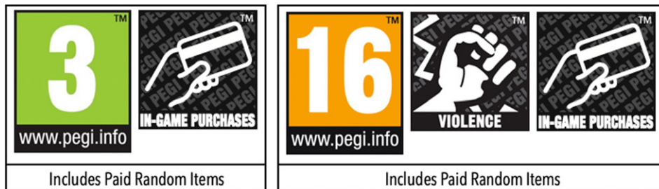
Figure 2. The originally announced, but since replaced, PEGI ‘In-game Purchases (Includes Paid Random Items)’ content descriptor.